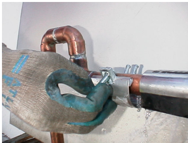
Spread open bottom section of clamp with nut facing out and slide on bottom half of clamp over top rubber section with arrows visible in the opening of bottom section.