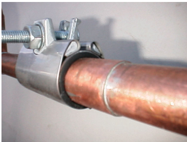
Retighten after 20 minutes...Leak is stopped!