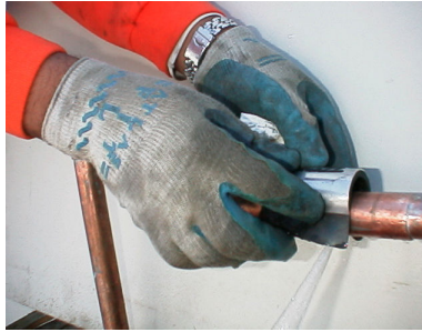
Loosen the bolt and separate the two parts of the clamp. Snap top half of clamp with rubber directly over leak