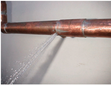
Leak at solder joint in copper pipe

(New Xylan coated nut prevents seizing on 3.00" and 4.00" Insta-Clamp Plus™ models)