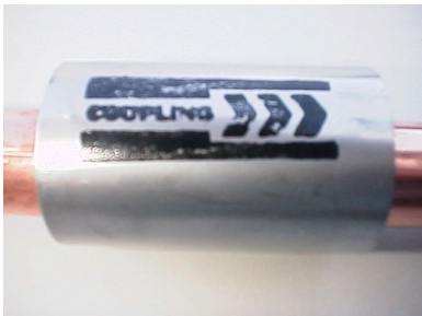
With arrows facing solder joint, slide over until flush with coupling